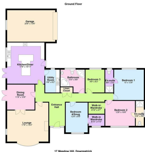
17 Meadow Hill, Downpatrick